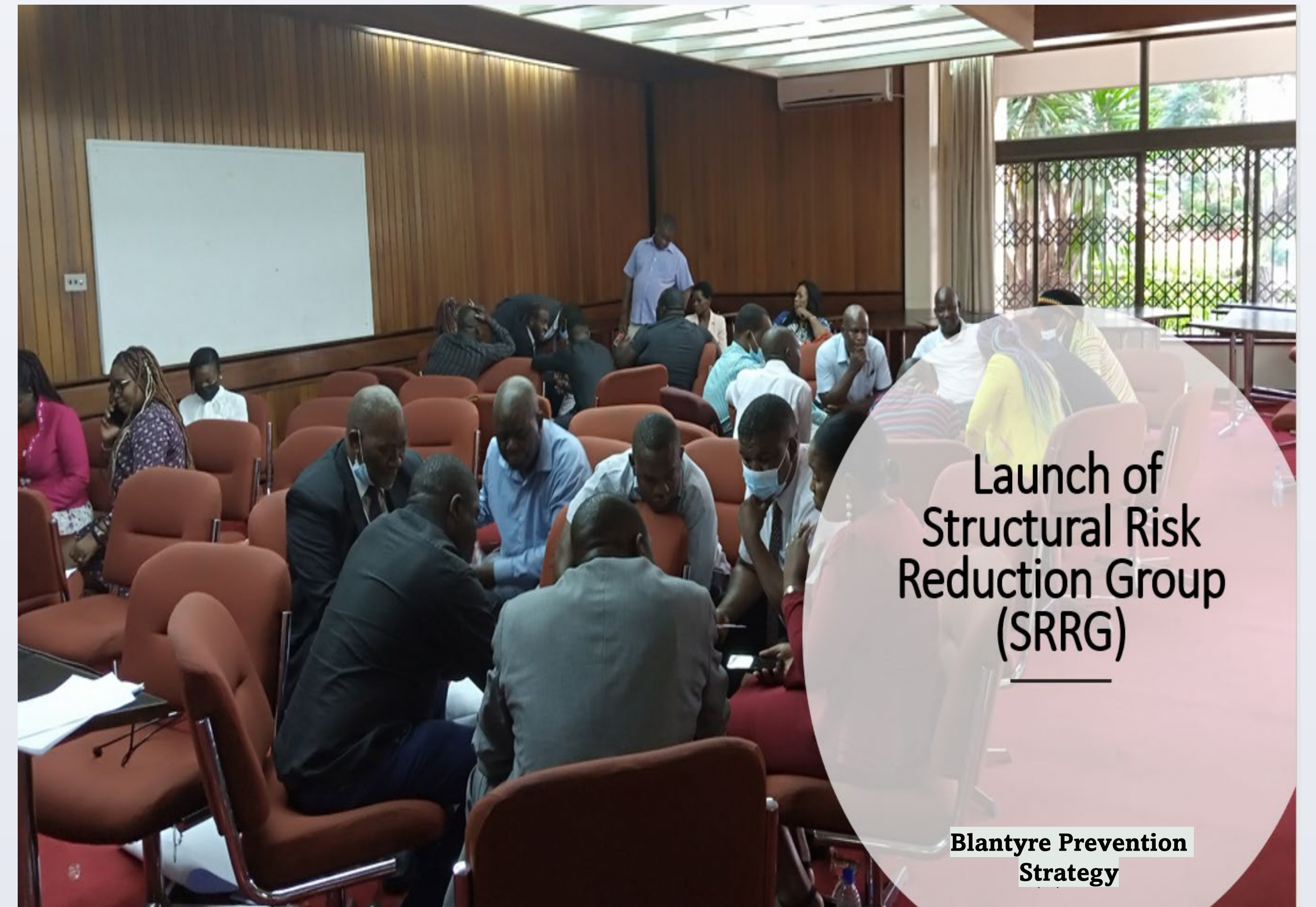
Fig. 2: Design and Launch of Structural Risk Reduction Group Comprised of Blantyre City Councillors