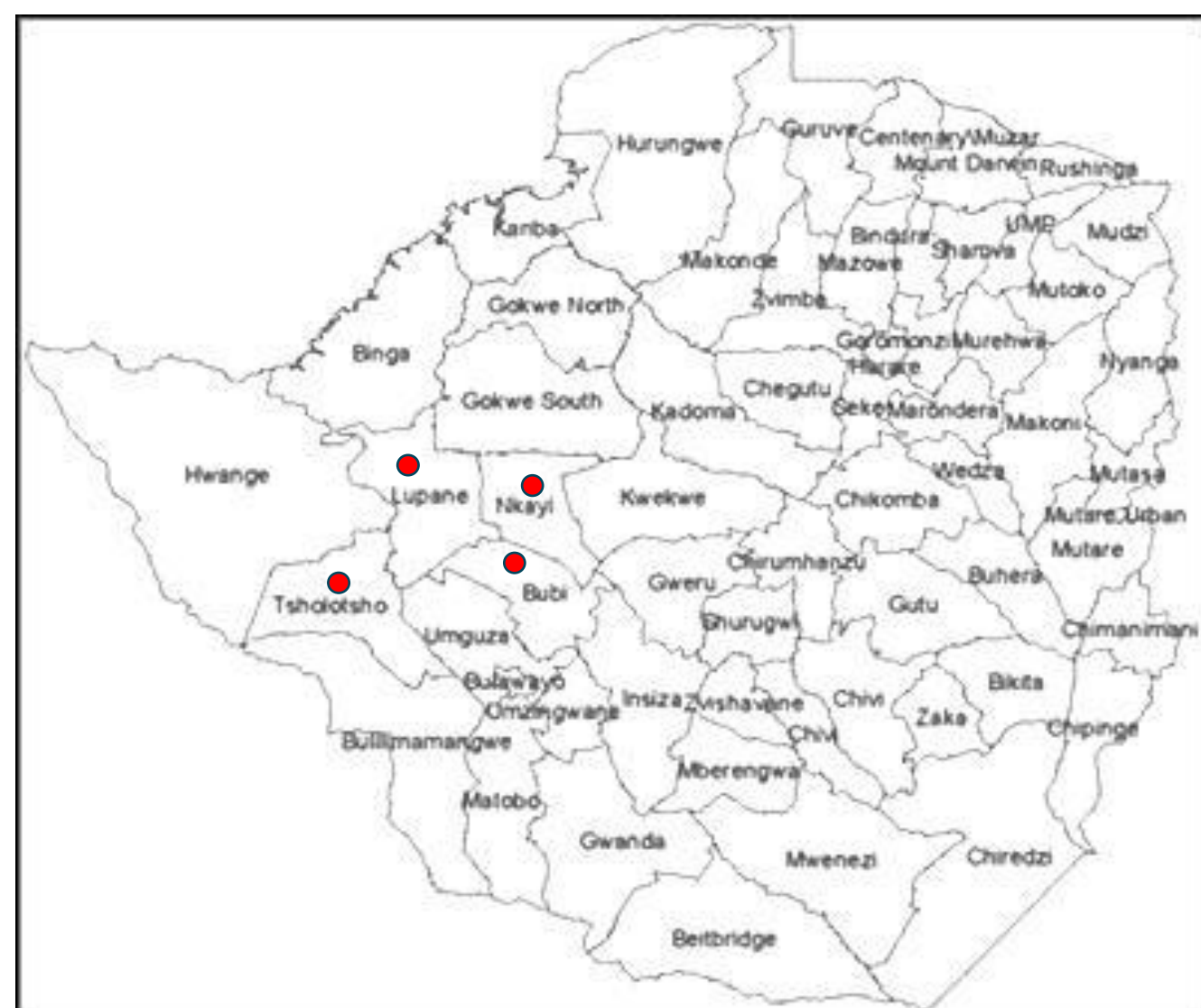
Figure 1: Map of Zimbabwe showing Matabeleland North Province-supported districts