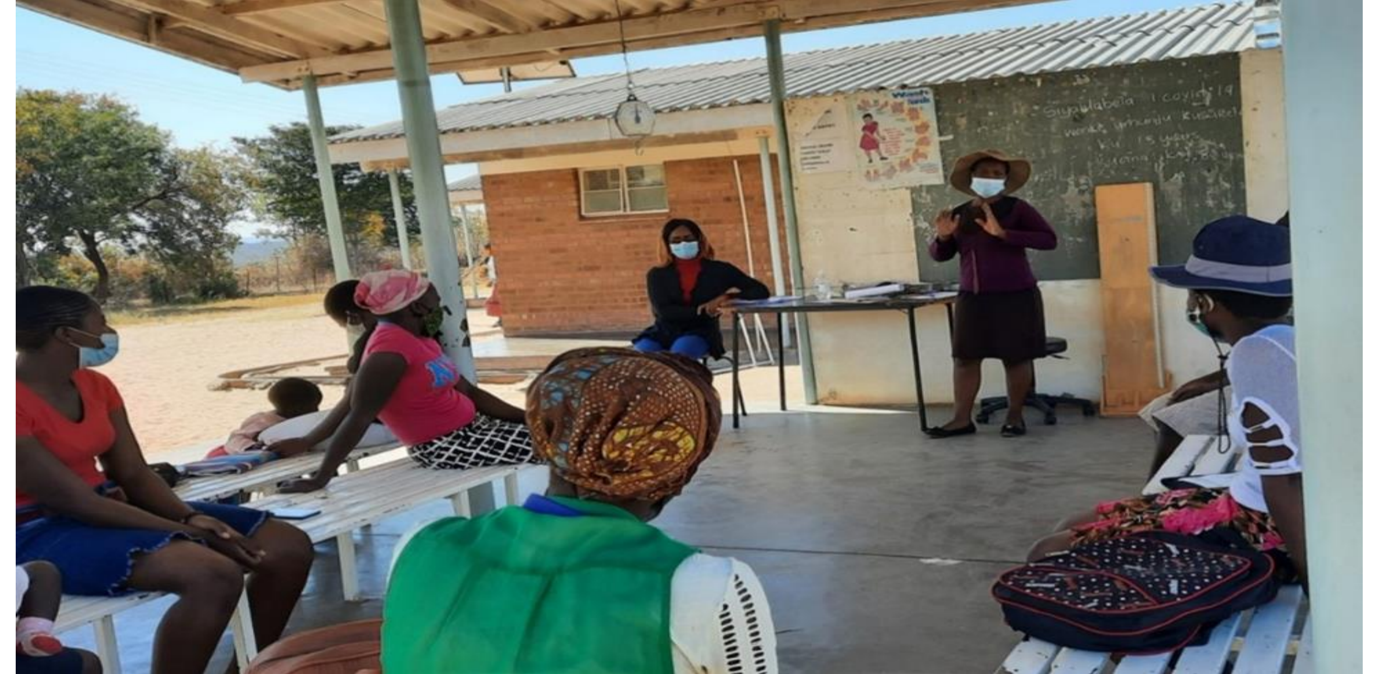
Image 1: The PrEP literacy session at Lukala Clinic in Bubi District, Matabeleland North