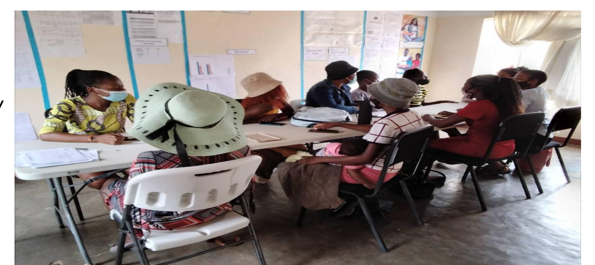
Image 2: PrEP adherence support group meeting for AGYW continuing on PrEP at a safe hub in Lupane District, Matabeleland North Province